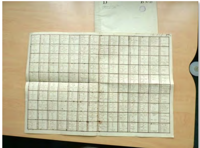
Fig. 4: Code table #24

The section in Fig. 5 shows the code number 1383 = "le Tage" already mentioned above.